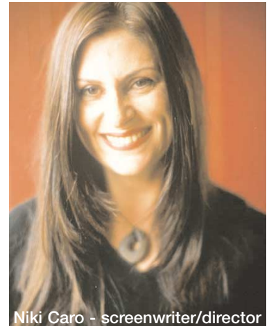
Niki Caro - screenwriter/director

Casting the role of Pai was an enormous task. 'I didn't want a child actor, I wanted a real child,' recalls Caro. 'I knew I wasn't looking not for 'a' girl that could do it, I was looking for 'the' girl. She didn't have to look a certain way, she didn't have to be a certain age...but we were looking for a special child.'